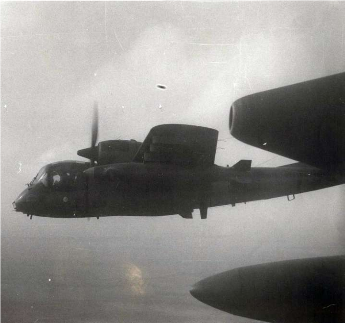
Two birds, I don't recall the pilots name or why we were in