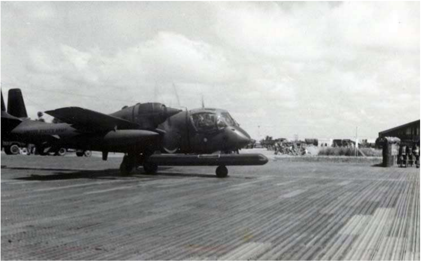
SLAR ship taking off to monitoring movement along the Cambodian border, Note: here at night, they burn anything they could to make sure the SLAR and Red Haze were rendered ineffective, a counter to the technology