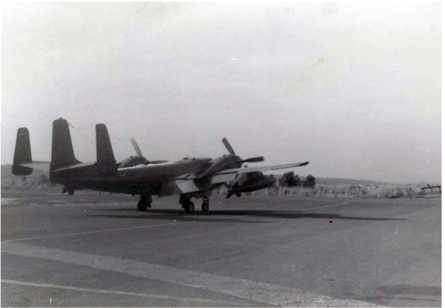
Aircraft getting ready take-off.